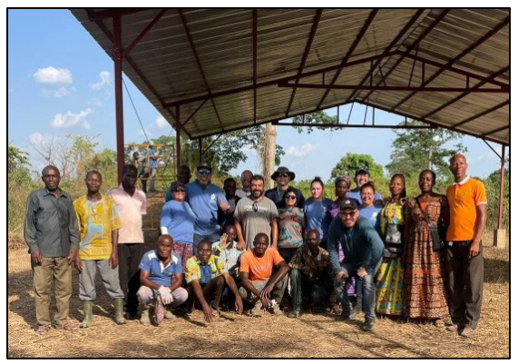
Above: Building a tabernacle in the town of Tiebissou and in a village near Daloa, Côte d'Ivoire.